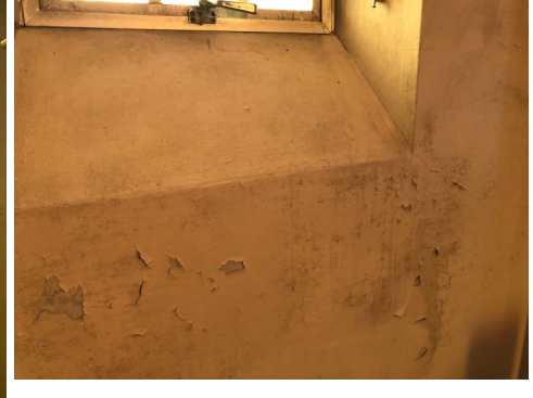
The dual issue: mould and peeling \( \backsquare \) paint